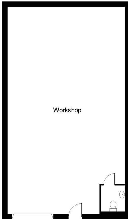
Unit 23b, Anniesland Business Park, Netherton Road, Glasgow